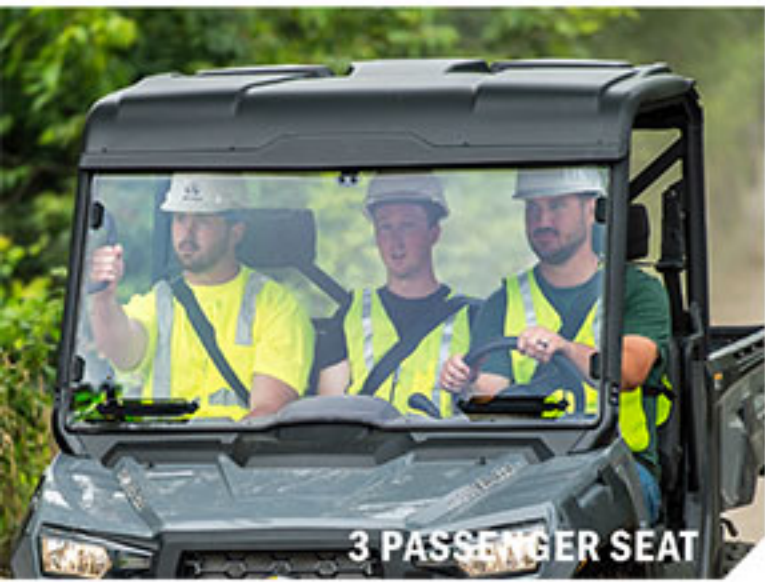
3 PASSENGER SEAT