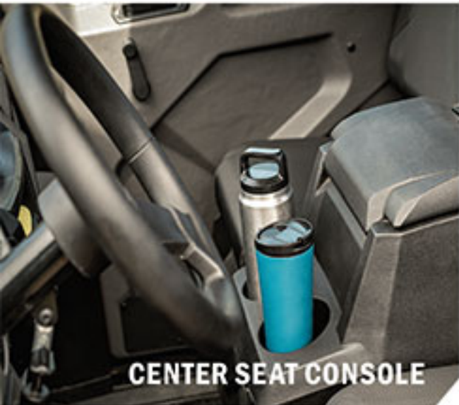
CENTER SEAT CONSOLE