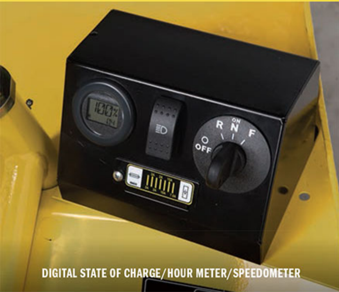
DIGITAL STATE OF CHARGE/HOUR METER/SPEEDOMETER